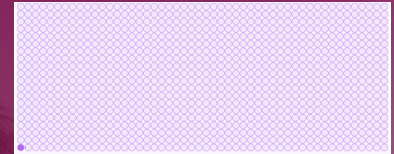
ORAL CLEFTS - EXPOSED TO ZOFRAN 14/10,000 pregnancies